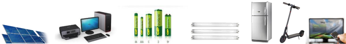
Table 1: Regulated Products

These regulated products are distinguished into regulated consumer products and regulated non-consumer products.